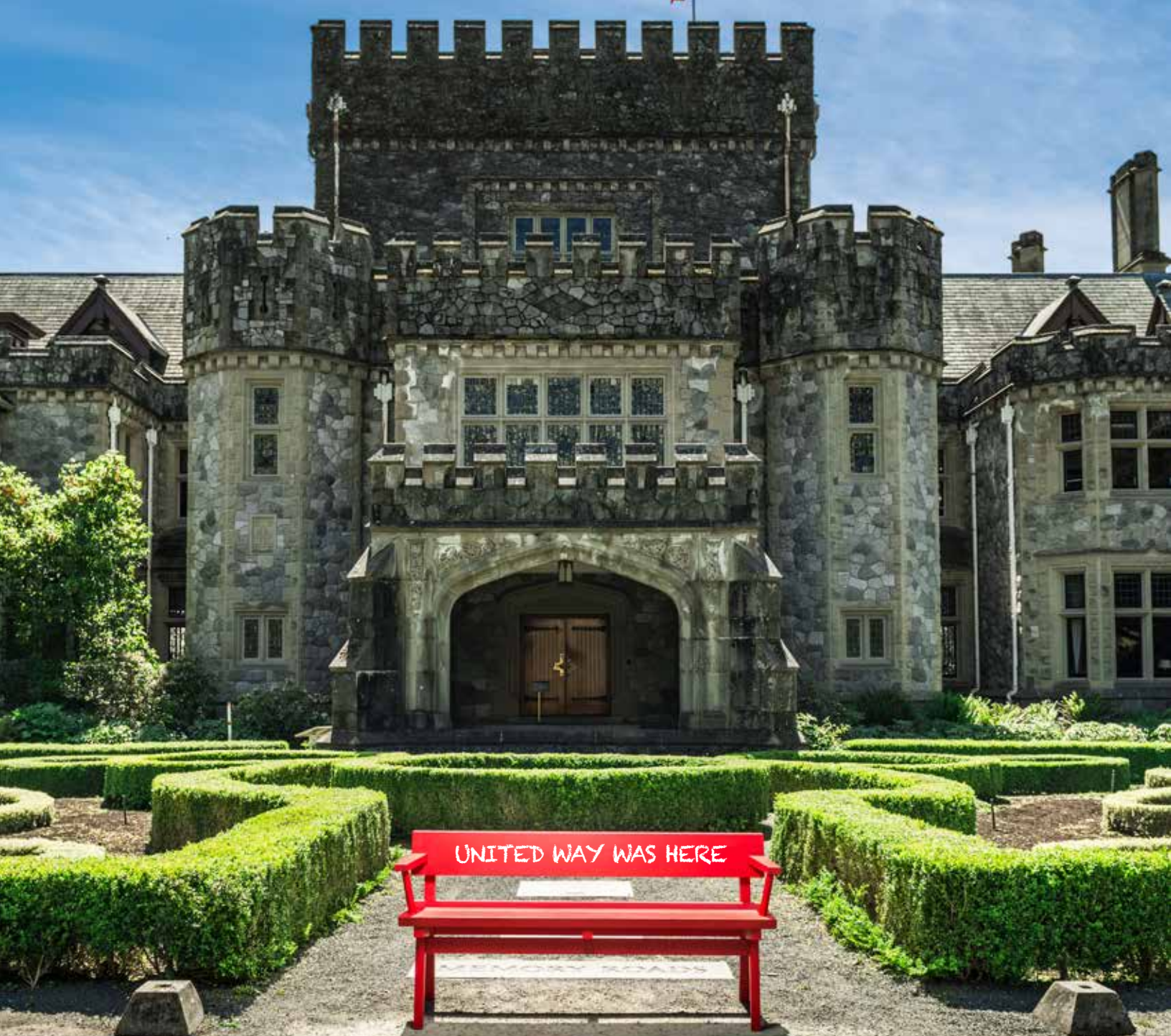
Royal Roads has a long history of dedication and enthusiasm when it comes to partnering with United Way. Their workplace campaign is a winning formula as it touches every single employee, giving them an opportunity to have an impact on their community through United Way.